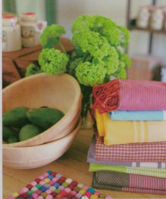
Clockwise from top left: Paso's Re:Find distillery tasting room; homey goods from the General Store; Re:Find's new limoncello; Peruvian ceviche at La Cosecha